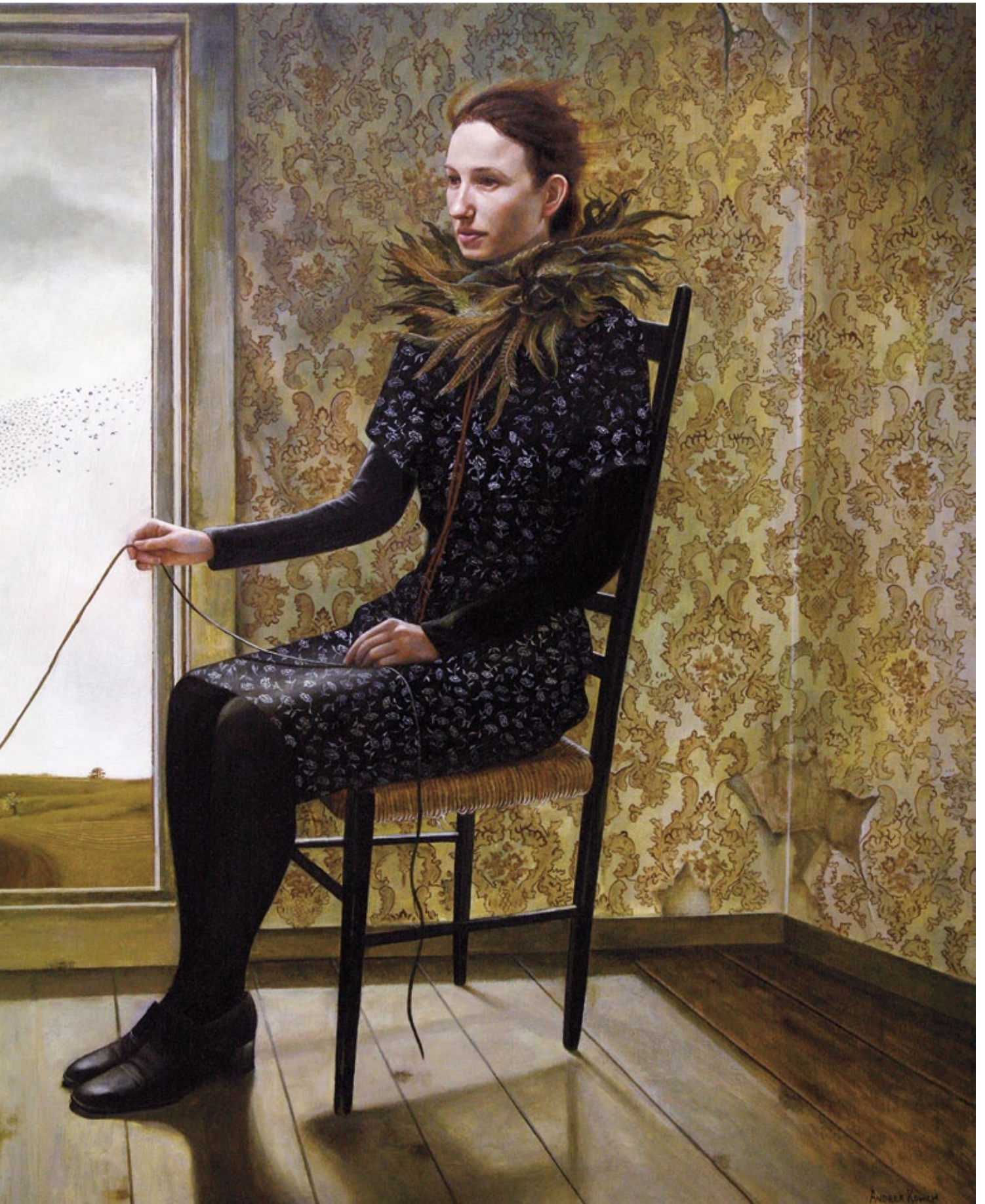
PHEASANT KEEPER, ACRYLIC ON CANVAS, 36 X 48"