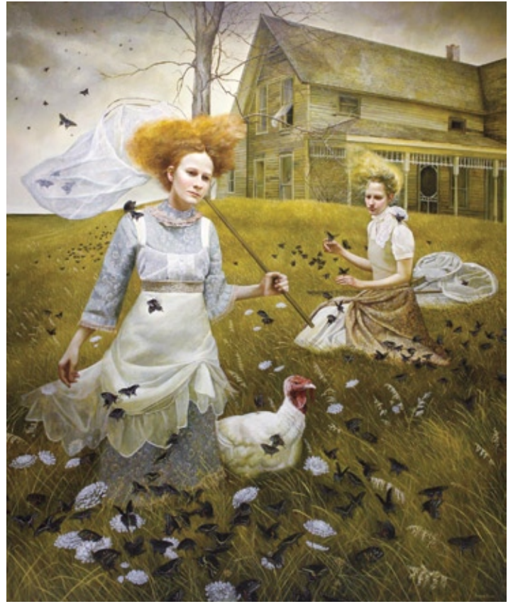
SOJOURN, ACRYLIC ON CANVAS, 72 X 60"