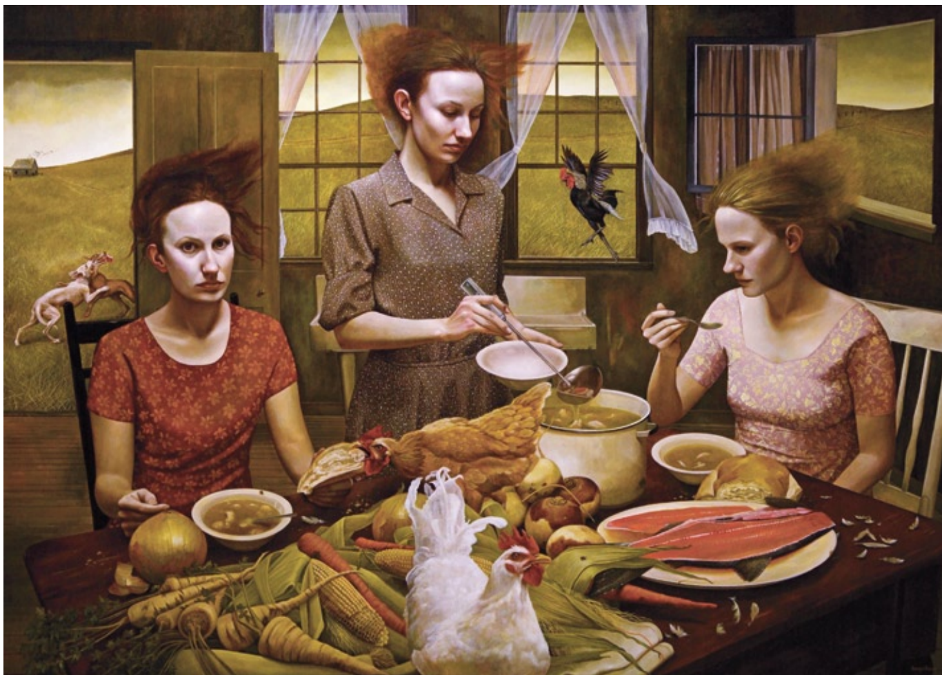
THE FEAST, ACRYLIC ON CANVAS, 60 x 84"

In this way, the narratives present in each painting are meant to link together to engage the viewer and pull them in.