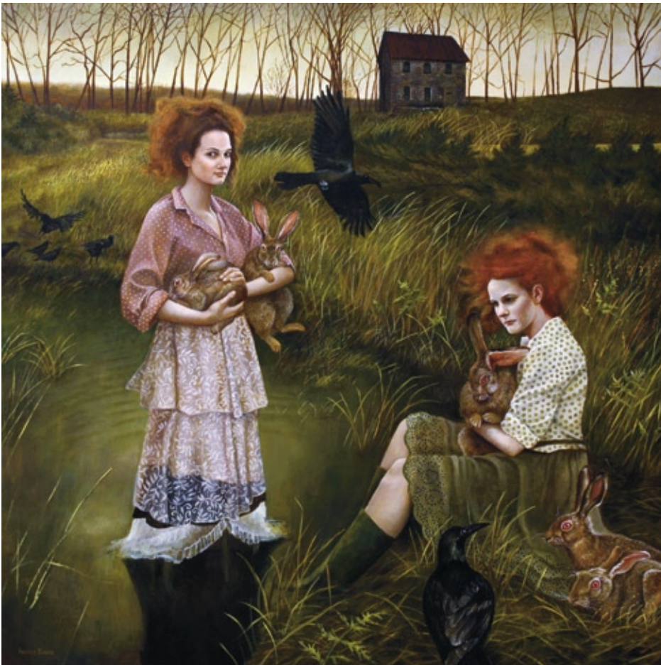
MARSH HARE, ACRYLIC ON CANVAS, 30 X 30"