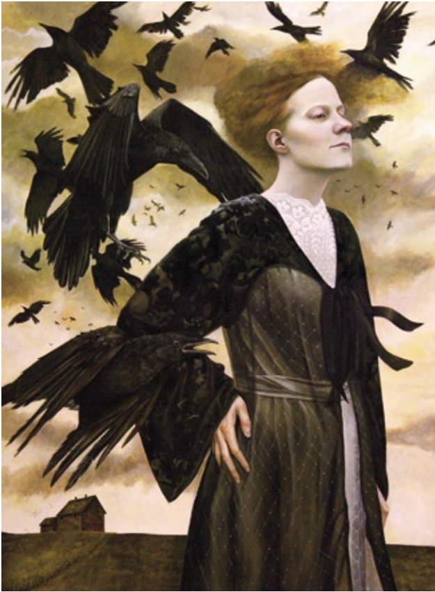
CROW'S SONG, ACRYLIC ON CANVAS, 48 X 36"